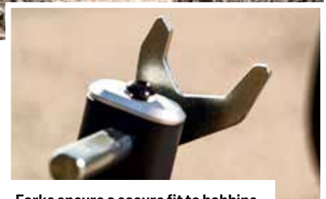
Forks ensure a secure fit to bobbins