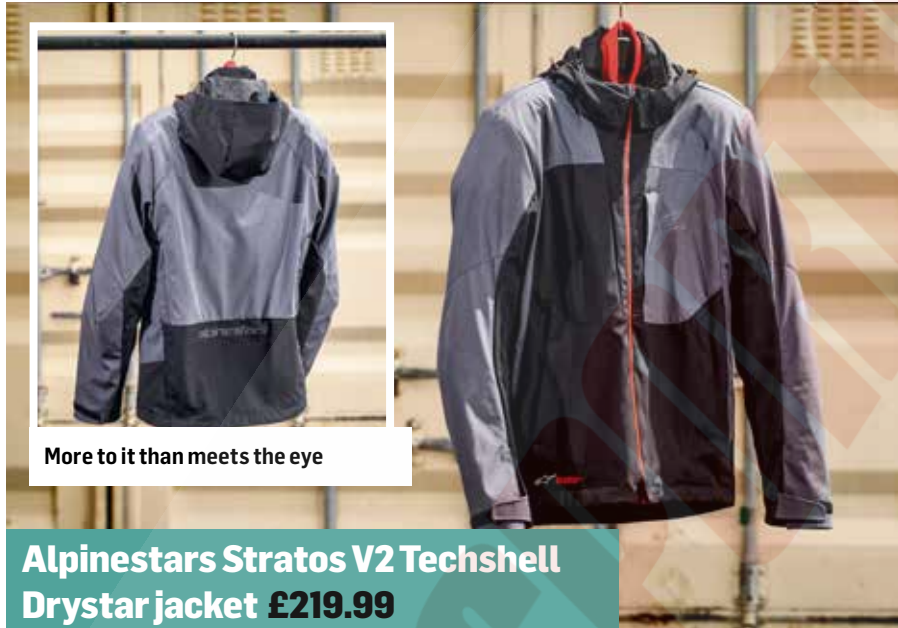
More to it than meets the eye

Quality ★★★★★ Value ★★★★★ www.sportsbikeshop.co.uk