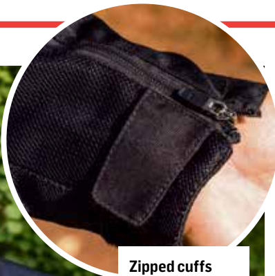
Zipped cuffs work well with biking gloves