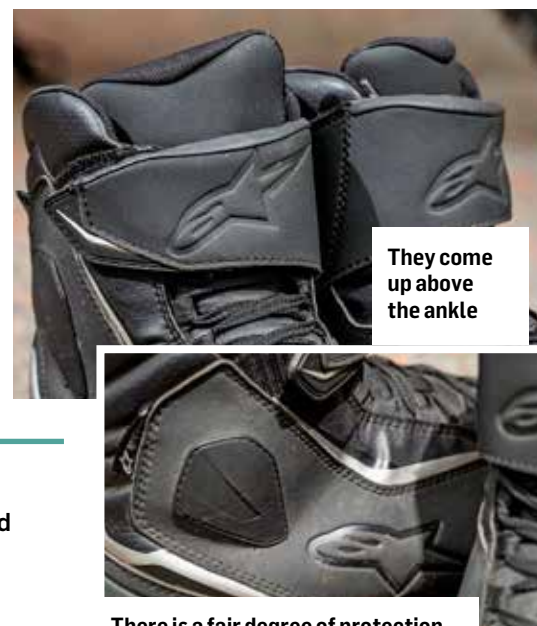
They come up above the ankle