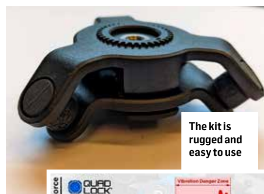
The kit is rugged and easy to use

Quality ★★★★★ Value ★★★★★ www.quadlockcase.co.uk