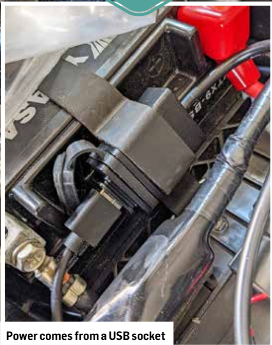
Power comes from a USB socket