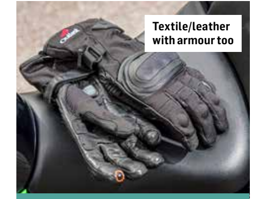
Textile/leather with armour too

Tested by Ben Clarke for 12 months From the first second I put the Easyrider on, I could tell there was more going on than in previous hoodies I've tested. It feels hefty (and actually quite heavy) but in a reassuring way – like it would actually make a difference if you suffered the misfortune of a spill. Riding hoodies are often A-rated, and so an AA-rating is above average. I've worn hoodies before where the elbow armour in particular flaps around all over the place in the breeze and leaves me wondering if it would be where I needed it to be in a slide. But because of the way the armour in the Roadskin is stitched to the lining (which fits closely to your skin), it stays put even at the national speed limit. You also get a pukka CE Level 2 back protector included, which is beyond my expectation at this price point and type of garment. Best of all, at £139.99, it is one of the cheapest products of its type on the market right now despite its protective qualities. I would definitely spend my own money on one. Quality ★★★★★ Value ★★★★★ www.roadskin.co.uk