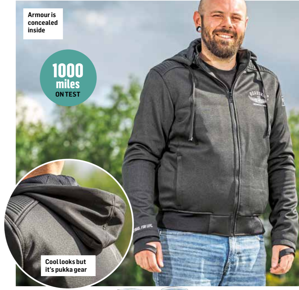
Armour is concealed inside

Batteries slot into the cuffs: It's easy but does make them a bit bulky