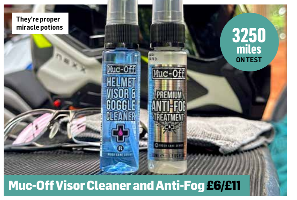
They're proper miracle potions