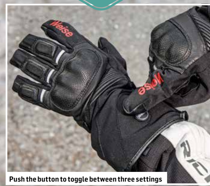
Push the button to toggle between three settings