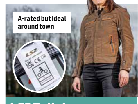
A-rated but ideal around town

insect guts, post-rain staining or general filth, quickly softening any stuck-on detritus and requiring nothing more than a gentle wipe with a microfibre cloth to clean off. The Anti-Fog demands a little more effort, but is worth its weight in gold, especially on my spectacles, which usually mist up at the merest suggestion of cold weather. Spray on a light coat, then buff out any streaks with a tissue, and it keeps them condensation free for about a week. It works just as well on the inside of a visor, too. Quality ★★★★★ Value ★★★★★ muc-off.com