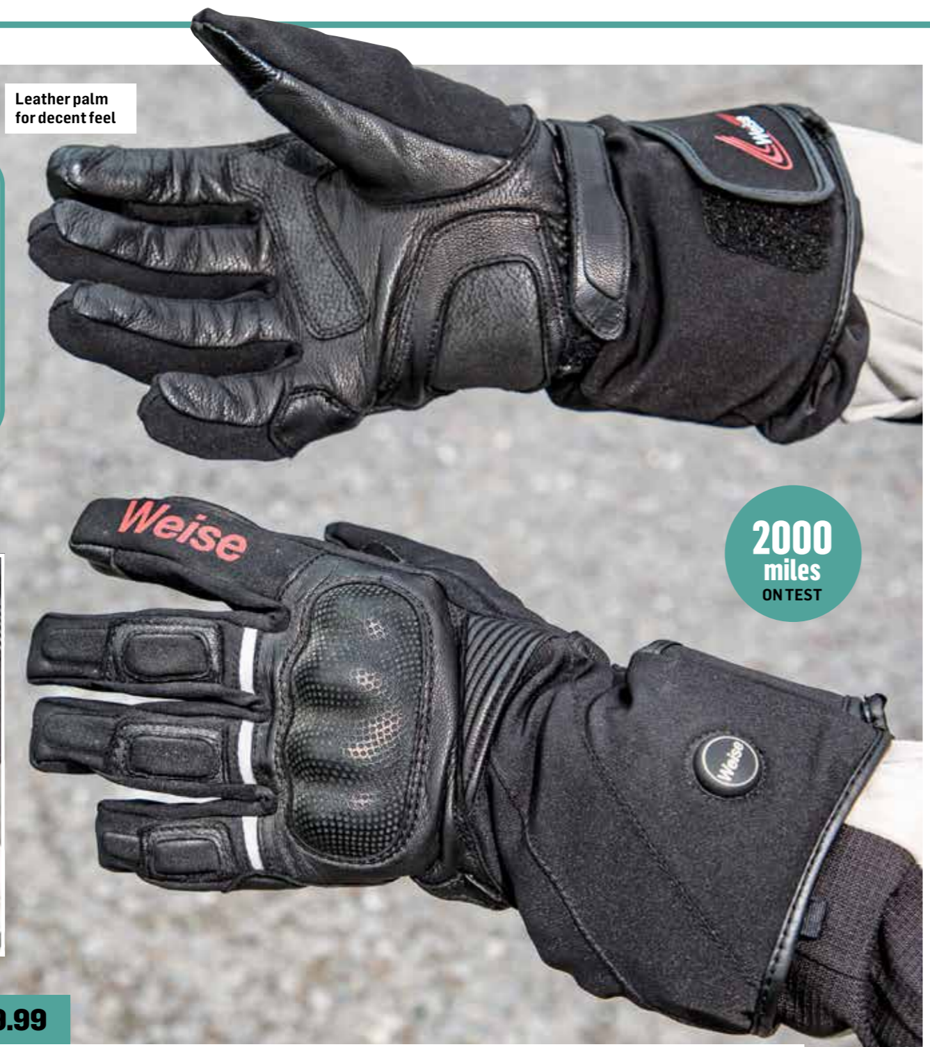
Leather palm for decent feel

TRIED & TESTED MCN STAFF RATE THEIR RIDING KIT ★★★★★