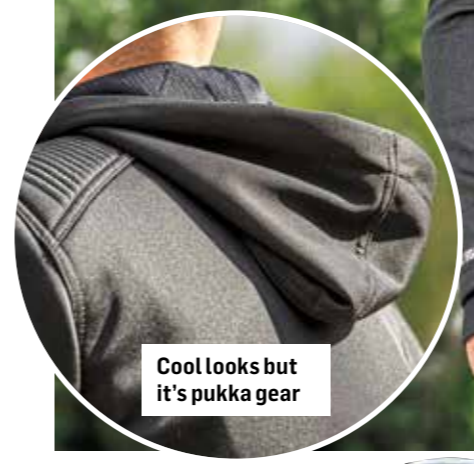
Cool looks but it's pukka gear