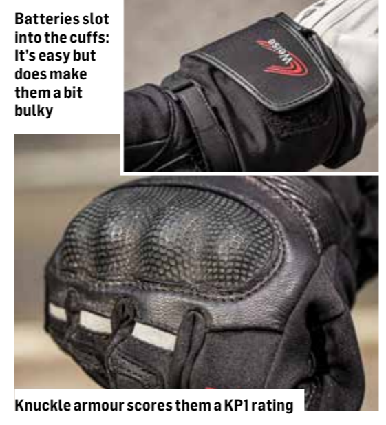
Knuckle armour scores them a KP1 rating

Batteries slot into the cuffs: It's easy but does make them a bit bulky