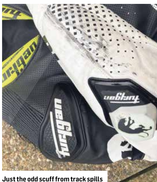
Just the odd scuff from track spills