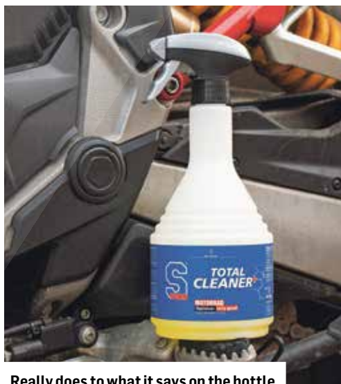
Really does to what it says on the bottle