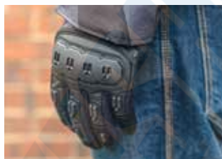
▲ Features Microlock armour

But confidence is not as high in these, due not only to the lighter material but also less protection across the hand.