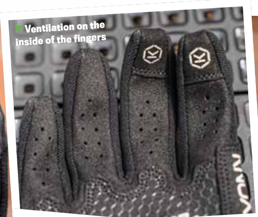
✓ Ventilation on the inside of the fingers