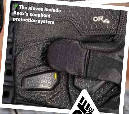
✓ The gloves include Knox's scaphoid protection system