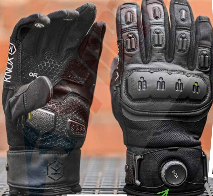
CUFF FASTENER The Knox gloves use a Boa fastener at the cuff for fast, accurate and easy-going operation.

Comfortable, a great fit and nicely ventilated, these work very well but are a little lacking in confidence.