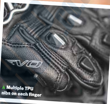
▲ Multiple TPU nubs on each finger

In addition to the leather construction, the TracTech Evo4s have an aramid fibre lining for abrasion resistance.