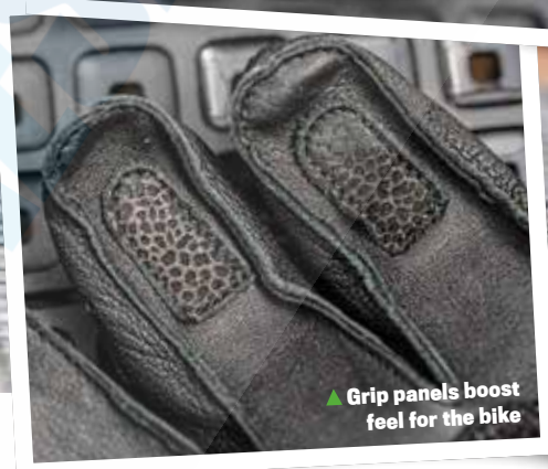
▲ Grip panels boost feel for the bike