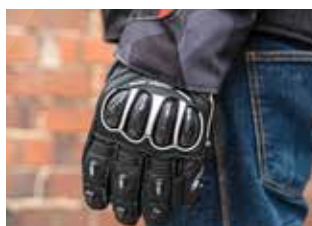
▲ Knuckle protection is significant

On the road, there’s a nice feeling of gentle cooling airflow with no feelings of clamminess. And despite not claiming it, they worked an iPhone’s screen.