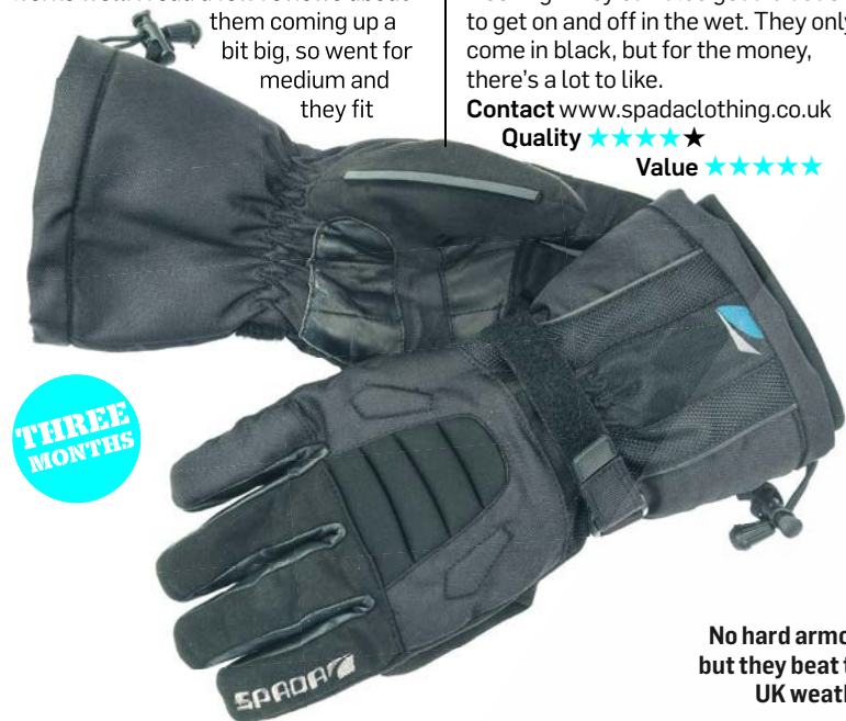
No hard armour, but they beat the UK weather