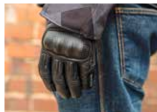
▲ Hard knuckle armour. Little else

Airflow with the hand closed around the grips was minimal, but with the fingers resting on the brake and clutch levers it was significant, suggesting the material used on the sides of the fingers gives the most. The touchscreen fingertips worked fine on an iPhone.