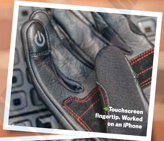
Touchscreen fingertip. Worked on an iPhone

If you ride with the fingers on the levers you'll notice good venting.