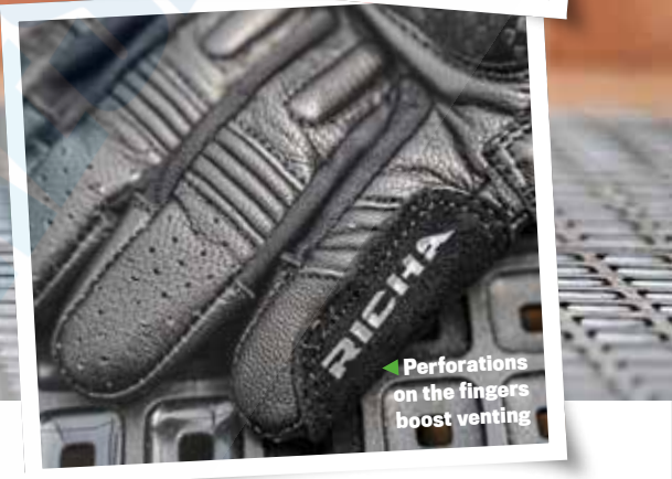
Perforations on the fingers boost venting