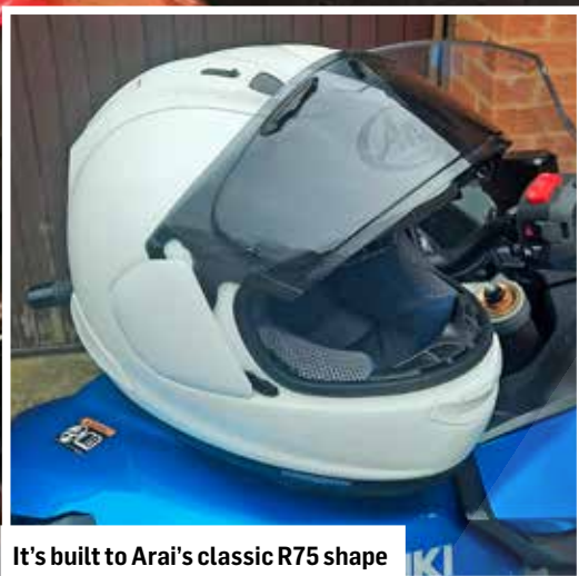
It's built to Arai's classic R75 shape