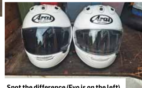
Spot the difference (Evo is on the left)