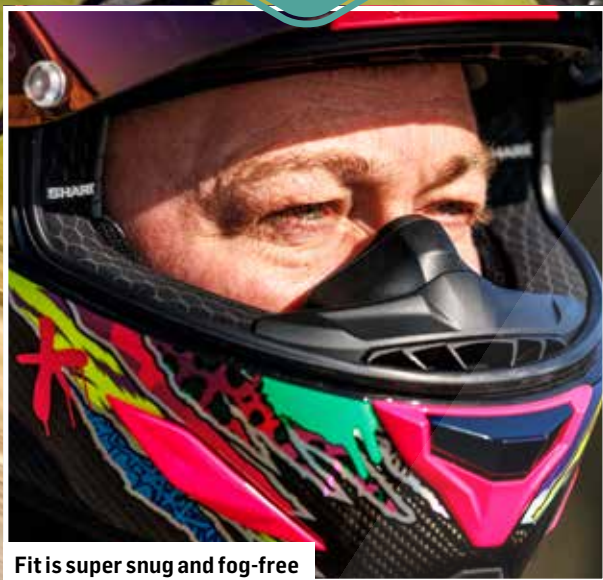
Fit is super snug and fog-free