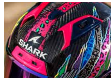
Air scoops help to keep a cool head