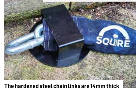
The hardened steel chain links are 14mm thick